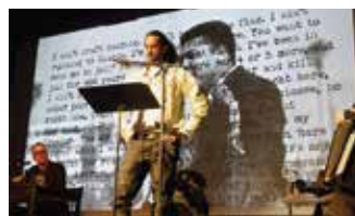
11:30-11:42 Letters Aloud Be The Change (Robin Klinger Entertainment)