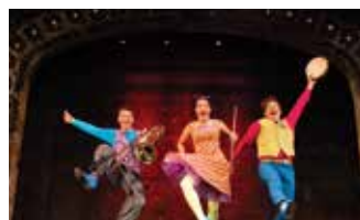
11:45-11:57 The Fourth Wall (GL Berg Entertainment)