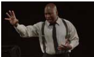
10:45-10:57 Literature to Life Black Boy by Richard Wright (Geodesic Management)