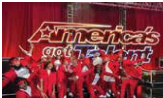
10:30-10:42 The Pack Drumline (Edustage)